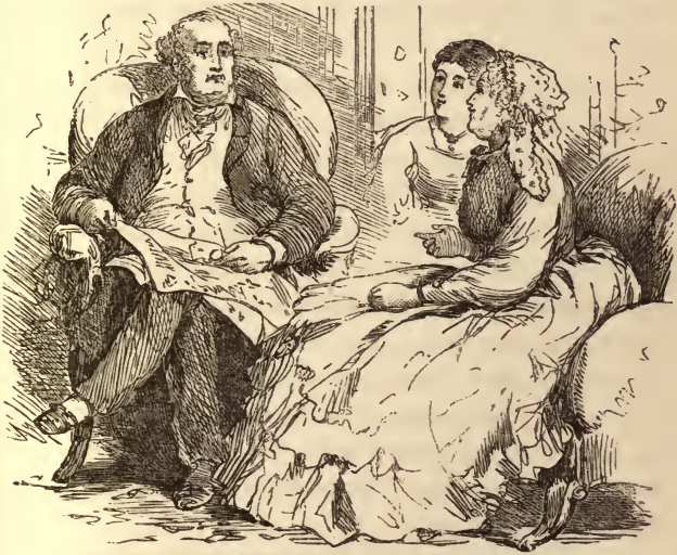
THE VAN ASTRACHANS.

"You know, dear," said Mrs. Van Astrachan to Rose, "that I never like to stay long away from papa" (so the worthy lady called her husband); "and so, if it's just the same to you, you shall let me have the carriage come for me early, and then you and Harry shall be left free to see it out. I know young folks must be young," she said, with a comfortable laugh. "There was a time, dear, when my waist was not bigger